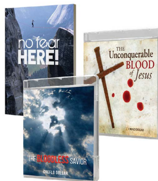
The Bloodless Savior (2-CD) The Unconquerable Blood of Jesus (3-CD) No Fear Here (Midi Book)