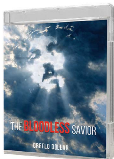
The Bloodless Savior (2-CD)