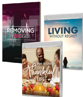
Living Without Regret (2-CD) How to Live a Thankful Life (3-CD) Removing Sin and Guilt (Midi Book)