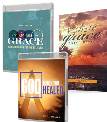
God Wants You Healed (3-CD) Grace: God's Provision for the Believer (4-CD) The Power of Grace Based Prayer (Mini Book)