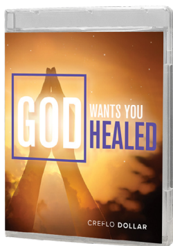
God Wants You Healed (3-CD)