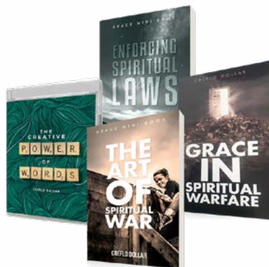
The Creative Power of Words (3-CD) Enforcing Spiritual Laws (Midi Book) The Art of Spiritual War (Midi Book) Grace in Spiritual Warfare (Midi Book)