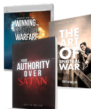
Winning in Spiritual Warfare (4-CD) The Art of Spiritual War (Midi Book) Your Authority Over Satan (Midi Book)