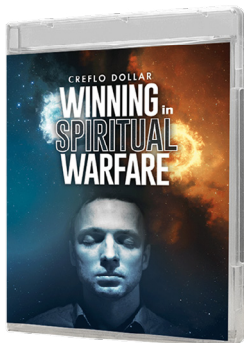
Winning in Spiritual Warfare (4-CD)