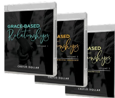
Grace-Based Relationships Bundle Volumes 1-3