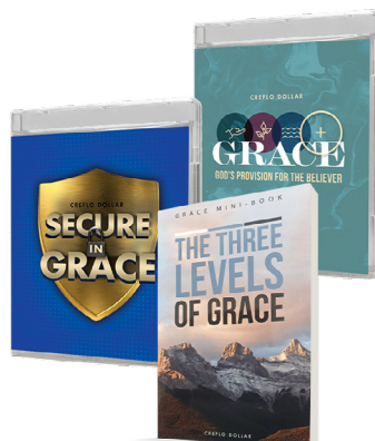
Grace: God's Provision for the Believer (4-CD)