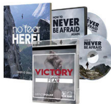
Victory over Fear 5 Message Series How to Never be Afraid Again 2 Message Series No Fear Here Mini Book