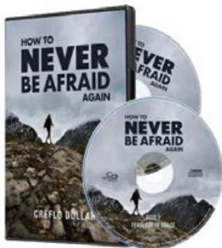
How to Never Be Afraid Again 2 Message Series

LOW END OFFER HOW TO NEVER BE AFRAID AGAIN