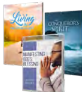
Manifesting God's Blessing (3-CD) Living the Prosperous Life (Mini-Book) The Conqueror's Spirit (Mini Book)