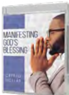
Manifesting God's Blessing (3-CD)