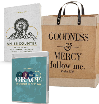
An Encounter: The How-To's of Experiencing God devotional Book

GRACE: God's Provision for the Believer 4 Message Series