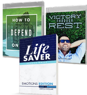
How to Depend on God 3 Message Series