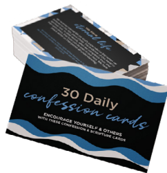
30-Day Confession and Scripture cards Cards