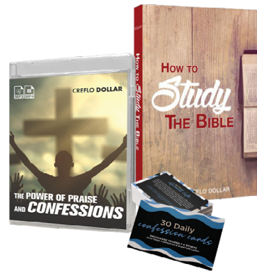
30-Day Confession and Scripture cards Cards The Power of Praise & Confessions 3 Message Series How to Study the Bible 4 Message Series