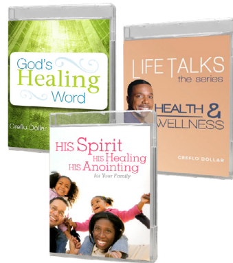
Life Talks: Health & Wellness 2 Message Series