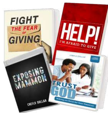
Exposing Mammon 3 message series Help I'm afraid to give Minibook Fight the Fear of Giving Vol. 1 2 message series Trust God: Relying on Christ for your Finances 4 message series