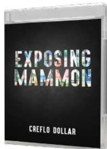
Exposing Mammon 3 message series