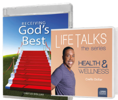
"Life Talks: Health & Wellness" (2-CD) Receiving God's Best (2-CD)