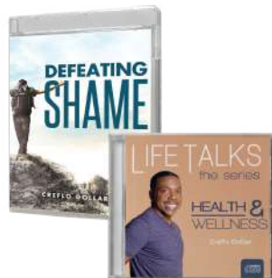
Defeating Shame (3-CD) & Life Talks: Health & Wellness (2-CD)